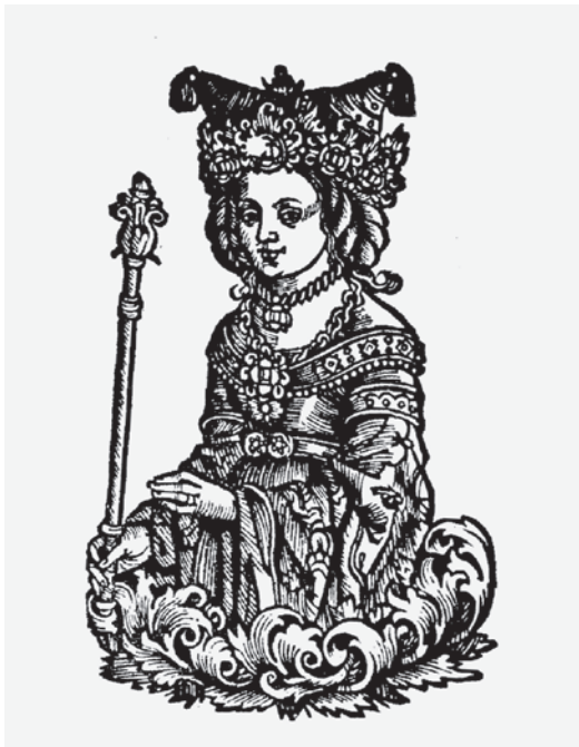
Fig. 2. Woodcut depicting the bust of Wanda, from the work of S. Sarnicki, Descriptio veteris et novae Poloniae (Kraków 1585), [in:] H. Morkowiczówna, Podanie o Wandzie. Dzieje wątku literackiego , Warszawa 1927, p. 5