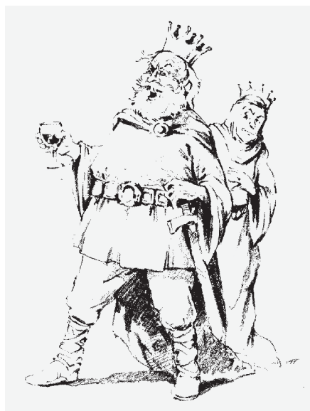
Fig. 5. M. Orłóń, Książę Popiel i myszy , [in:] Legends i baśnie polskie , retold by A. Sójka, il. by A. Fonfara, Poznań 2006, p. 10.