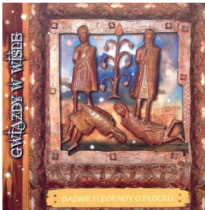
Fig. 8. Baśnie i legendy o Płocku. Gwiazdy w Wiśle , Płock 2008, cover