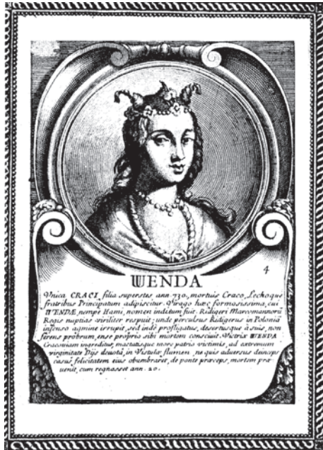
Fig. 1. Copperplate nr 4 in the series of 51 photographs Fotografie królów i książąt polskich , ryt. Benedictus Fariat, [in:] H. Morkowiczówna, Podanie o Wandzie. Dzieje wątku literackiego , Warszawa 1927, p. 33