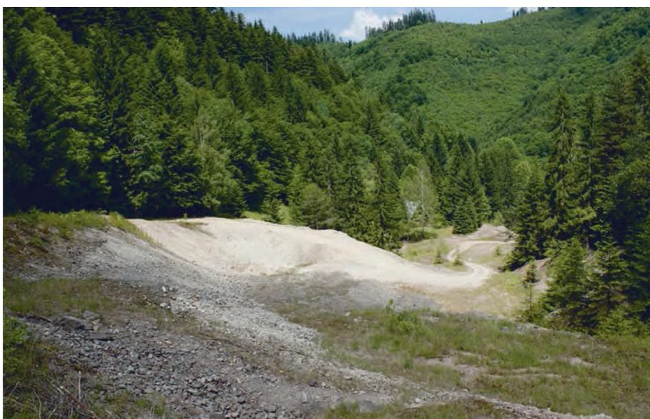
Fig. 4. Mine heap Richtárová

cover reaches 30%–40%. On a relatively flat top part of the mine heap a forest habitat is established in which the highest plant diversity was recorded. On surfaces without humus and fine earth grow only lichens – the most dominant group of organisms on the mine heap, represented mostly by genera Rhizocarpon , Cladonia , Cetraria , Lecanora and Peltigera .