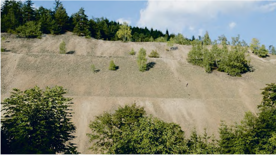
Fig. 5. Mine heap Maximilián

The most wide-spread grass is also Agrostis capillaris which often forms monocultural overgrowth among lichens. Among herbs the most frequent species are Arabidopsis arenosa , Acetosella vulgaris and Silene dioica . Pioneer tree species such as Betula pendula , Salix caprea , Picea abies , Pinus sylvestris and Abies alba are present sporadically. They often have a dwarfish appearance, deformed shape or weakened vitality (Aschenbrenner et al., 2011).