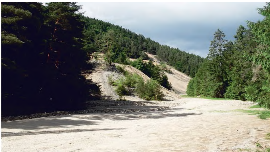
Fig. 3. Mine heap Podlipa