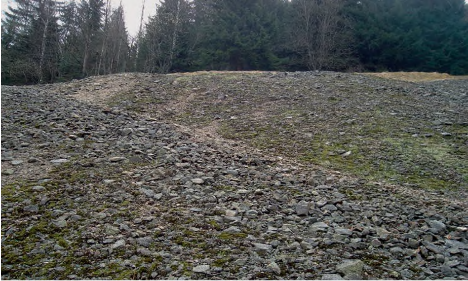
Fig. 1. Initial successional stage with bryophytes