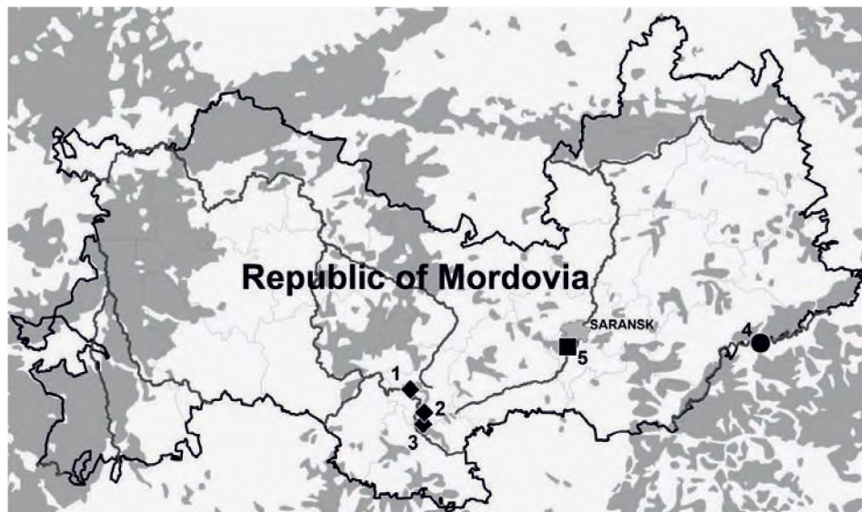
Fig. 1. Allocation of studied localities with Acer species in the Republic of Mordovia. Symbols: rhombs – localities with Acer campestre in Kadoshkino district: 1 – Insar station, 2 – Latyshovka, 3 – Adashevo; 4 (circle) – locality with Acer tataricum and Acer negundo populations in Bolshie Berezniki district; 5 (square) – locality with Acer negundo in Saransk

The field investigation of A. negundo populations were carried out in Bolshie Berezniki district of Mordovia (54.176 N, 46.181 E) and on wasteland in Saransk (54.164 N, 45.150 E) in years 2014–2015 (Fig. 1). Within each of these localities, we