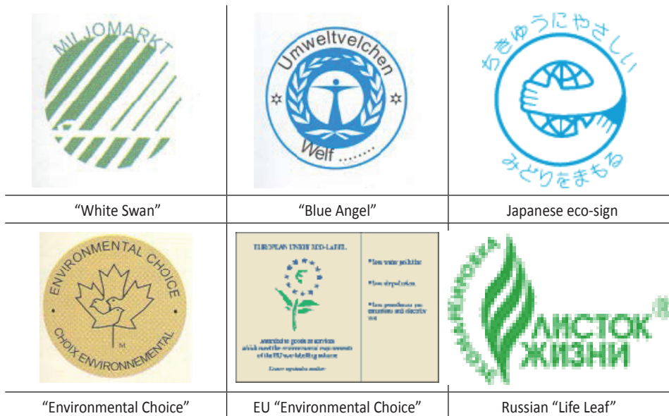
Fig. 3. Ecolabels on the environment friendly goods

The first subgroup (see Fig. 3) informs about the environmental friendliness of the goods, safety of their production or they specific qualities influencing life, health, consumers and environment. There is a variety of ecological signs, e.g., “White Swan” (Scandinavian countries), “Blue Angel” (Germany), “Environmental Choice” (Canada), a green and blue flower – the stylized image of a dandelion – the badge of ecological compliance accepted in the EU countries. The sign of Japanese Association for Environmental Protection informs that the product minimally pollutes and destroys the environment. A similar sign exists in Russia.