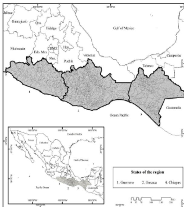
Fig. 1 Map of the South Pacific Mexican region

Regarding health characteristics in the region, 30 out of 100 inhabitants do not have an affiliation to a public or private medical institution. There are 4,033 public medical units, of which 0.14% are highly specialized hospitals, 5.08% are general hospitals, and 94.76% are primary-care hospitals. The proportion of doctors and nurses at the national level is 21 and 19 respectively per 10,000 inhabitants, while in the region it is 8.7 and 16.4 respectively (SS, 2020).