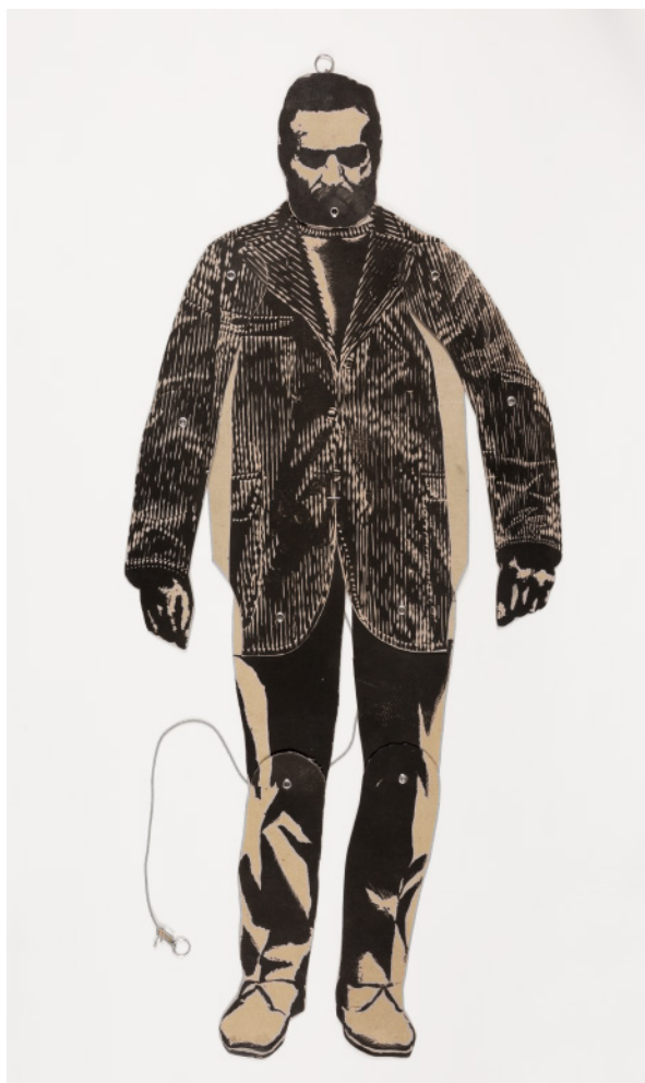
Fig. 2. Janusz Kaczorowski, Pajac [Clown], Collection of Woodcutting Studio, Faculty of Graphic Arts, Academy of Fine Arts, Krakow