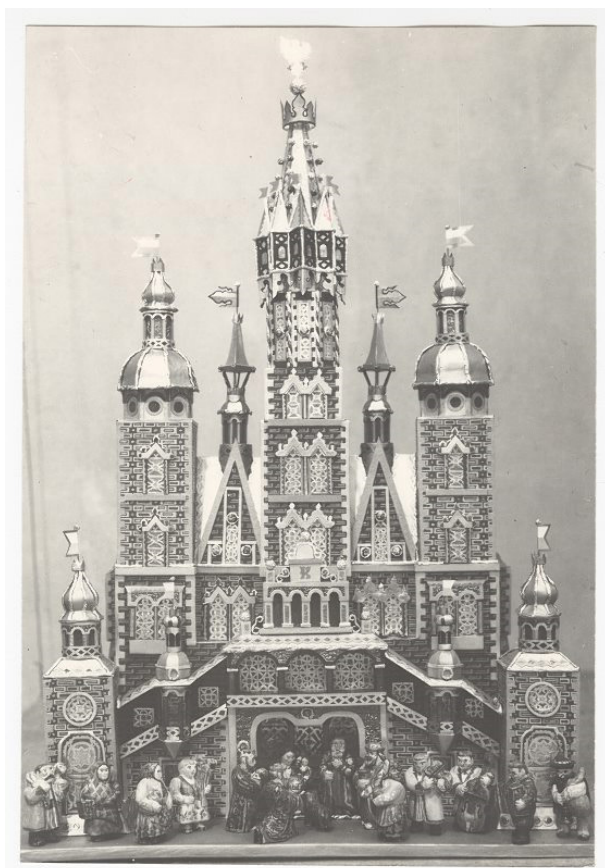
Fig. 1. The 25 th Jubilee Nativity Scene Competition, 6 December 1967, szopka no. 79, 2 nd prize, author: Kaczorowski Janusz, 26, Academy of Arts student.

the reference number 2580 / F / IX 1 . Based on the photograph, it is difficult to determine the dimensions of the cardboard structure [fig. 1]. Most probably, it was not large – as for a Krakow szopka , of course. Five towers inspired by those of St. Mary's Church at the Main Square, shiny domes on drums, inspired by the Sigismund Chapel. The whole is dotted with ornaments, flags, and balconies, with staffage in addition: figures of small people dressed in Krakow traditional style. In a word, everything that a Krakow szopka should be and what a conditioned avant-garde artist despises as a standard. The photo documents the szopka , which received the second prize at the 25 th Jubilee Krakow Szopka Competition, which took place on December 8, 1967. The author is Janusz Kaczorowski, 26, a student of ASP [Academy of Fine Arts].