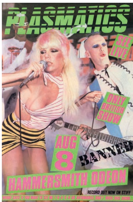
Il. 1. Poster promoting the performance of the band Plasmatics at the Hammersmith Odeon in London in 1980.

The performer's artistic communication exceeded the borders of playing (with) carnality, shocking stage acts, concert robustness, manifested by things like cutting guitars with a chainsaw, firing a shotgun and making Cadillacs explode on stage. Apart from her expressive performance activities, the singer's multimodal artistic narrative was also a clear manifestation of her views expressed in cover iconography, song lyrics or interviews. The content of the verbal-musical pieces performed by Williams was characterised by sometimes very primitive simplicity, vulgarity, nihilism and literalism. Nevertheless, her works contained a critical vision of the world and the society, especially when it came to privileged groups, elites and the political establishment.